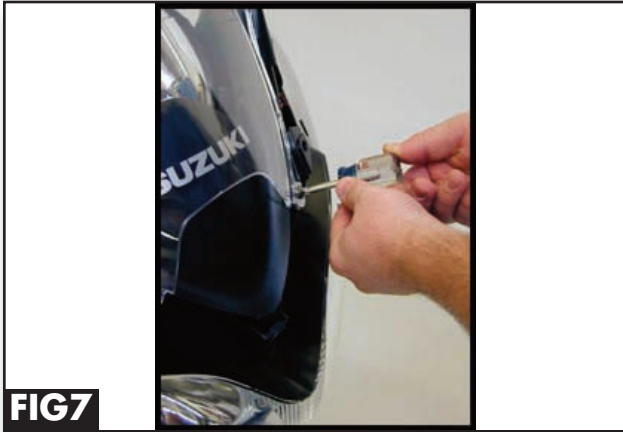
Fig 7. Remove the 2 screws that fasten the rubber well-nuts.

Please see www.zerogravity-racing.com for further information concerning this product.