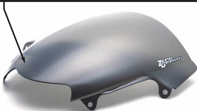
Zero Gravity Windscreen

ZG screens DON'T have Rectangle holes to mount cover screen. So cover screen is omitted.