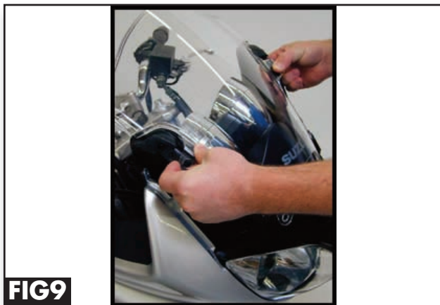
Fig 9. You can try to do it this way, but it's hard to do without breaking the screen.