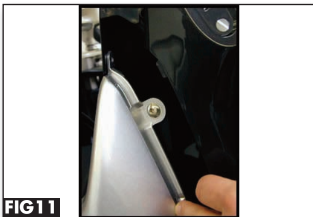
Fig 11. A closer view of the plastic tabs and the slots. (For reference.)