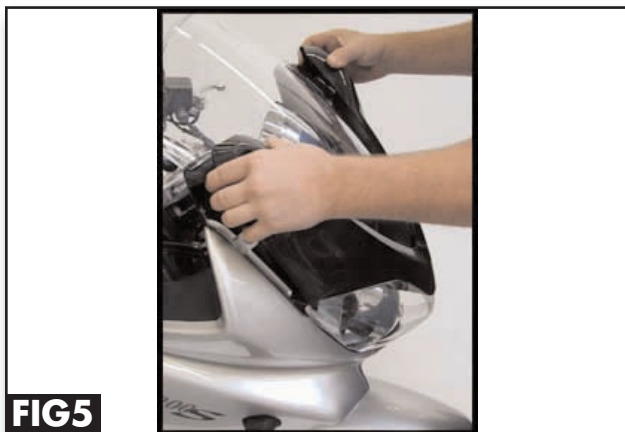
Fig 5. You can see the tabs on the V-shaped part and the slots that they fit into on the silver fairing. The tabs break very easily. If you happen to break one or more of these, don't worry. These don't affect the fitment.