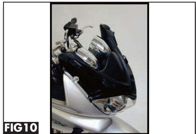
Fig 10. View of the bike with no screen.