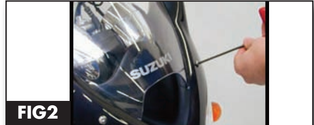
FIG 2. Remove the 2 screws at the front of the fairing.