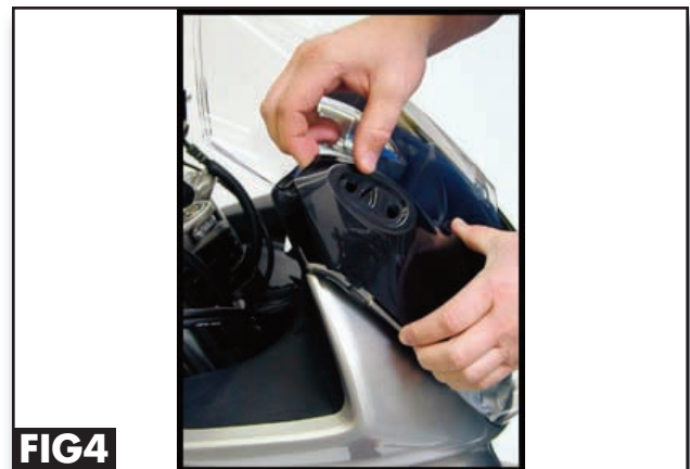
Fig 3. HERE IS THE TRICKY PART! You have to carefully pry the charcoal V-shaped piece from the fairing. It is held in place by two tabs on each side (see FIG5) and by a plastic pin at the bottom that pushes into a rubber grommet. (See FIG6).