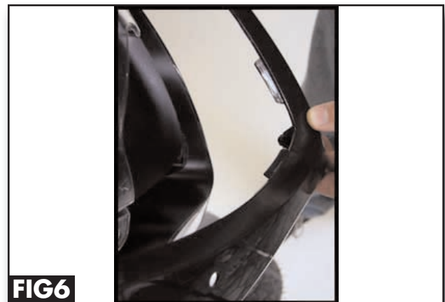
Fig 6. The rubber grommet is fixed to the fairing and you will need to pull the v-shaped piece away. If you were standing in front of the bike looking at the screen, you would pull it straight towards your body.