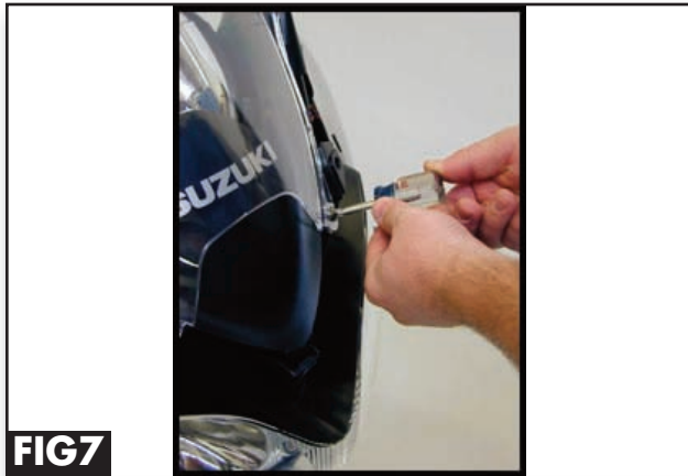
Fig 7. Remove the 2 screws that fasten the rubber well-nuts.

Please see www.zerogravity-racing.com for further information concerning this product.