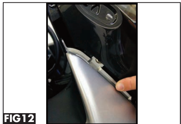
Fig 12. A closer view of the plastic tabs and the slots. (For reference.)