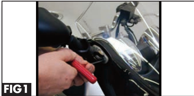
FIG 1. Remove both mirrors. The fasteners are under the rubber boots. Don't drop the mirrors!

PLEASE READ BEFORE MOUNTING YOUR WINDSCREEN