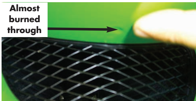
Almost burned through

Photo above: Kawasaki ZX10R behind the instrument cluster, a Parabolic Reflection created and made a dimple in the fairing. Owner was using a clear aftermarket windscreen.