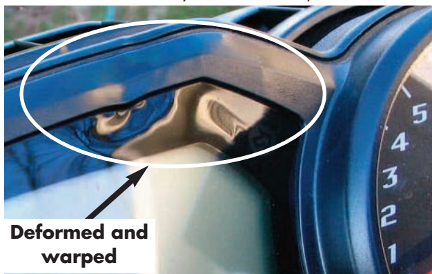
Deformed and warped

Below: To share with you some of the parabolic mirror effects and the damages done.